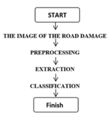
Fig. 1 The flow chart of research method stages.

The research was conducted in Depok area. The object was road damage including cracks, crocodile skin cracks and holes. Data retrieval of images from road damage, using a Canon 550D digital camera. The steps of research method as shown in Figure 1.